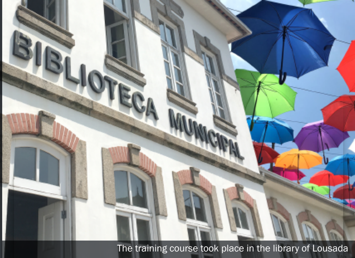
The training course took place in the library of Lousada