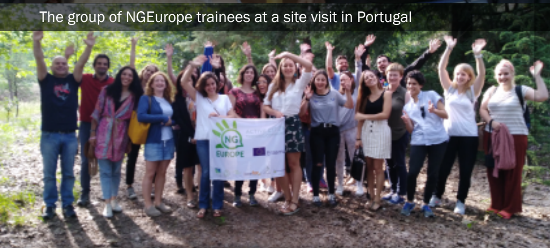
The group of NGEurope trainees at a site visit in Portugal