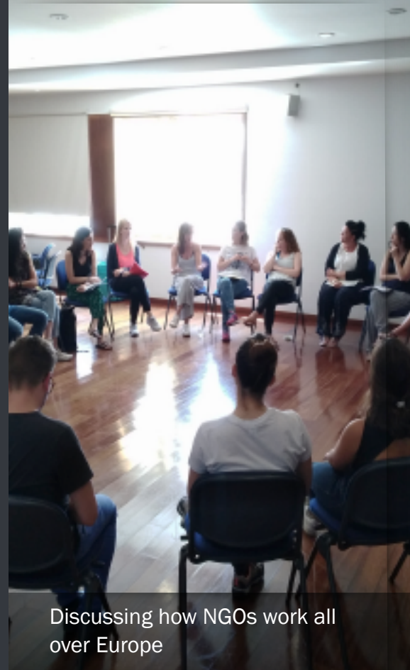
Discussing how NGOs work all over Europe