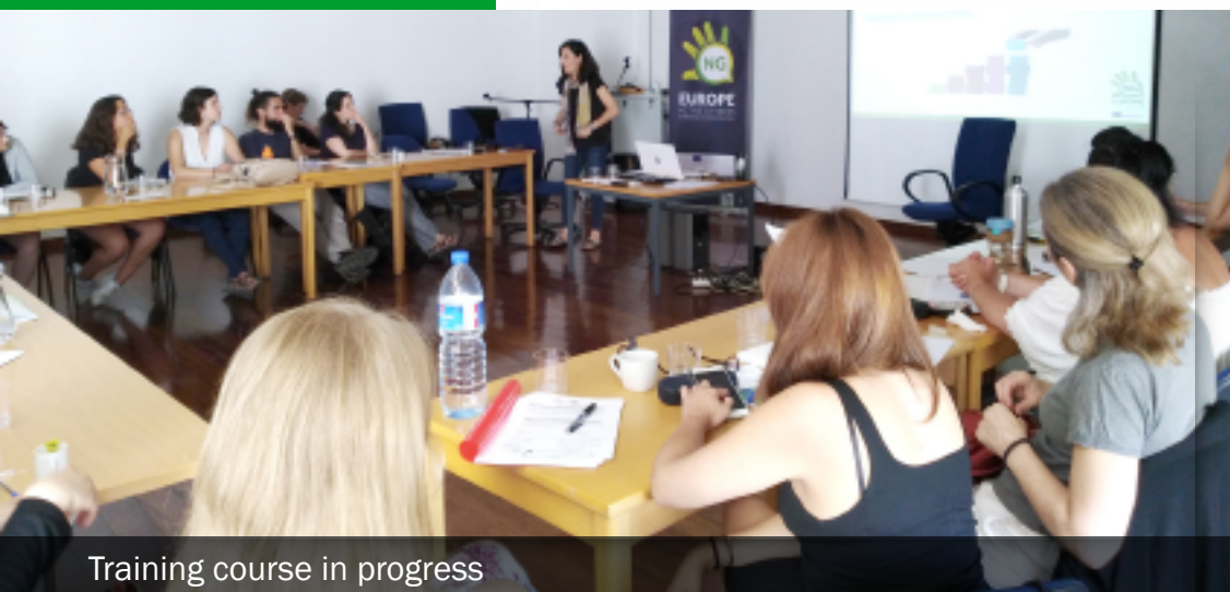
Training course in progress

The NGEurope trainers used their expertise to guide the trainees on their way to reach the course goals in a positive and encouraging learning environment. They motivated the course participants to give their best and to practice how to become social leaders. Everybody had the chance to take an active role in the learning experience. Trainers and trainees alike were excited to be part of this European experience.